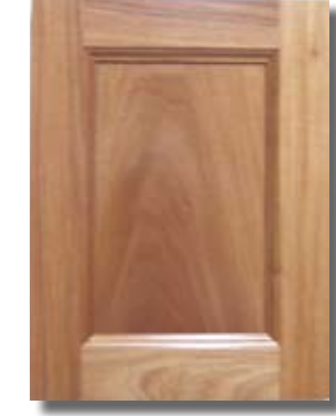
African Danta CD7